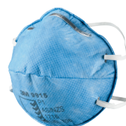
9915 P1 respirator