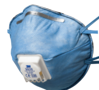
9926 P2 respirator