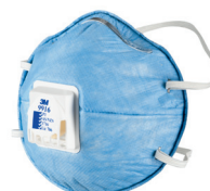
9916 P1 respirator