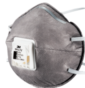
9913V GP1 respirator