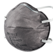
9913 GP1 respirator